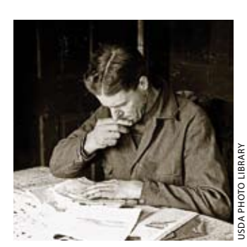
A farmer meticulously reviews his accounts.