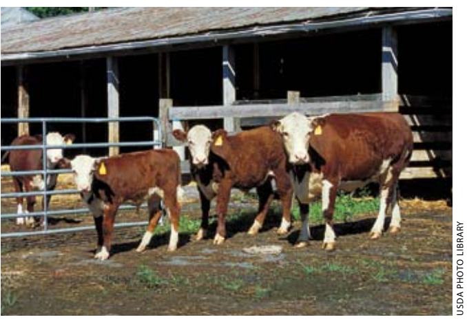
Hereford cattle in Anne Arundel County, Maryland.