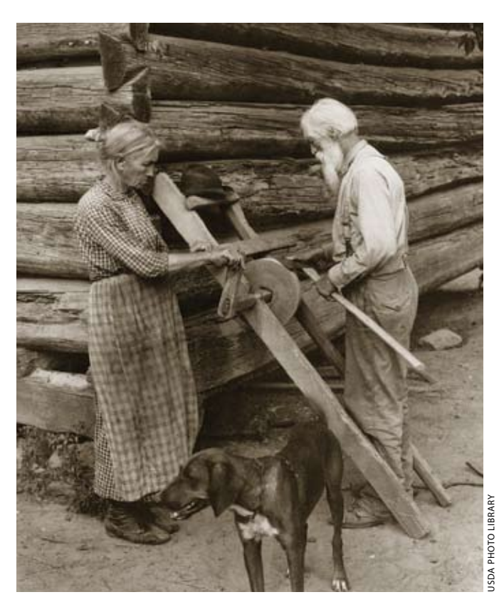
Farmer and wife sharpening ax.

Texas longhorn cattle were driven along the Chisholm Trail, the major route north. The cattle boom accelerated settlement of the Great Plains and sometimes fueled range wars between farmers and ranchers.