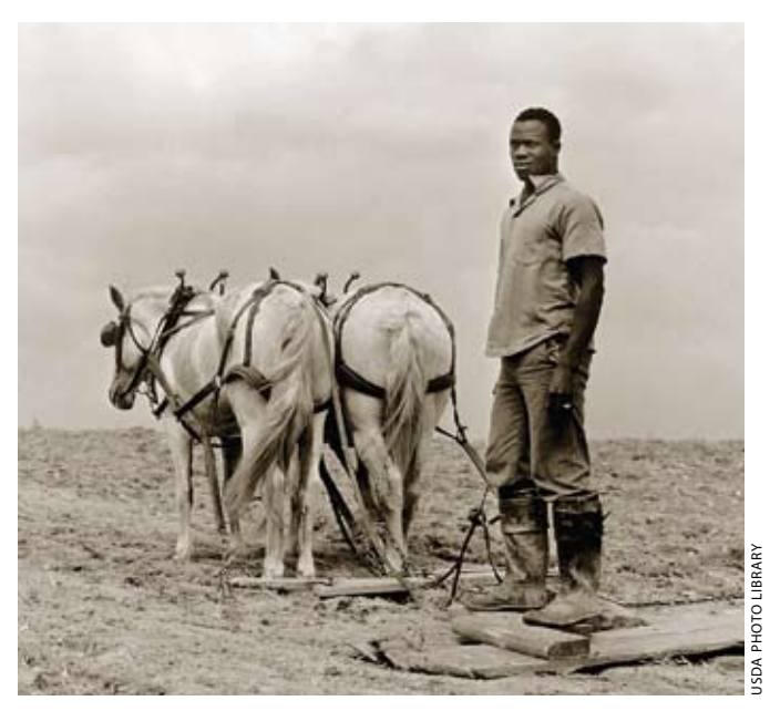
Farmer preparing cropland.

The amount of land under cultivation between 1870 and 1890 expanded from 408 million to 840 million acres. New machines such as the steam tractor were introduced. With larger acreages and better machinery, the production of corn, wheat, cotton, tobacco, and other crops continued to increase tremendously. Factors other than surplus production that kept agricultural profits low included increasing transportation costs, a restricted supply of currency, and an unrestrained international market.