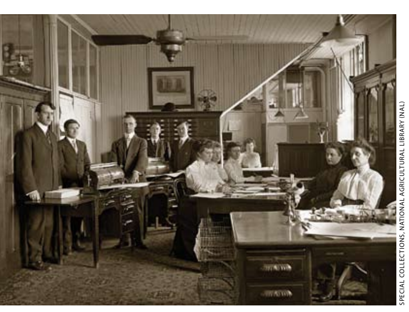
NASS office at USDA headquarters in Washington, D.C.—1910.

Golden Age of Agriculture. Between 1900 and the end of World War I, the demand for farm commodities increased, land values rose, and during part of the period, farm prices went up faster than nonfarm prices. The first two decades of the twentieth century became known as the golden age of American agriculture.