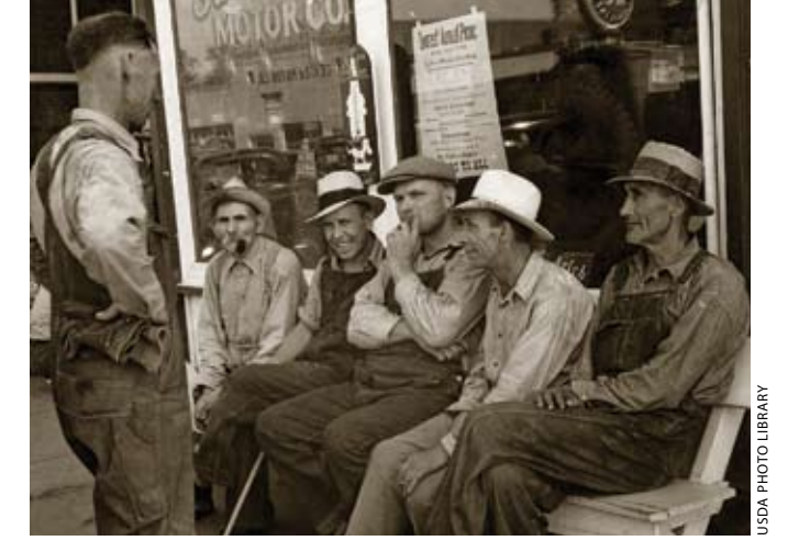
Farmers having an informal discussion.