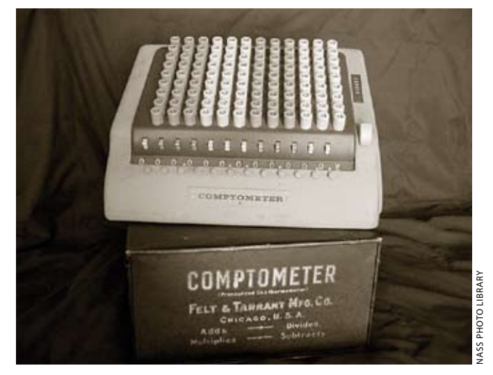
Comptometer, a mechanical calculator.

Post World War I Recession. Farm prices had been high during World War I because of European demand and government price fixing. By 1920, the European demand dropped and farm prices were determined by a free market. The urban economy was strong between 1922 and 1929, but agriculture did not share in the Nation's general prosperity. Farm income increased from $10 billion annually in 1919 to about $44 billion in 1921, and then plummeted and leveled off at about $7 billion a year from 1923 through 1929.