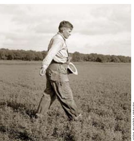
Spreading grasshopper bait in Oklahoma—1937.

lem of saving livestock. Weekly and semi-monthly reports were called for to answer questions about how much feed was available and where and how many cattle and hogs were involved. The Drought Relief Act appropriated disaster-type loans to farmers for planting crops or feeding livestock, but in actual practice some of the money went for family