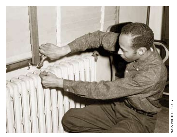
Securing window blinds.

The agency has in its history a misfortune—the 1905 inside trading scandal—that laid the cornerstone for creating the Agricultural Statistics Board. Today all survey data and summaries are controlled on a strict need-to-know basis and secured when not in use. Not even the Secretary of Agriculture or an Under Secretary will know a report's contents until entering the lockup area to sign it just before release.