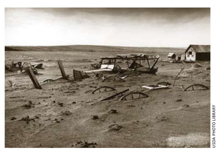
Machinery buried by blowing soil—1936.

Statistics for Drought Assessment. To add to the Depression woes of low prices, a severe and prolonged drought in the 1930s covered the Corn Belt and southern Great Plains. In 1934 the average corn yield of 16 bushels per acre was the lowest on record. Conditions improved somewhat in 1935, but 1936 was almost a duplicate of 1934. In large areas, crops were wiped out and pasture conditions were critical, creating a prob-