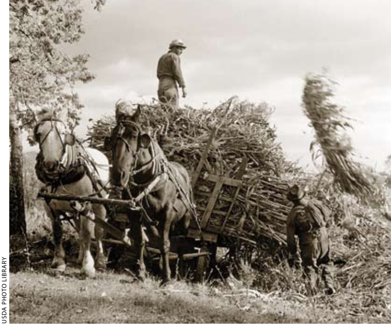
Loading corn shucks.

First Agricultural Census. In 1839, Commissioner of Patents Henry Ellsworth prevailed upon Congress to designate $1,000 for "carrying out agricultural investigations, and procuring agricultural statistics." Then, in 1840, detailed agricultural information was collected through the first Census of Agriculture, which provided a nationwide inventory of production. Using the census information as a benchmark, Ellsworth used other annual data to make agricultural estimates for each year between the 10-year census cycle.