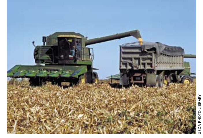
Harvesting corn near Stockton, Kansas.

Overvalued Land Creates Crisis. For a number of years in the 1970s, American landowners saw the prices of farmland increase in value beyond the capacity of the land to produce adequate income to pay for the loans. However, through refinancing purchased land, producers were able to buy even more farmland. When inflation slowed, overleveraged producers and the rural banks that had made the loans faced a financial crisis. By 1987, farmland values bottomed out after a 6-year decline.