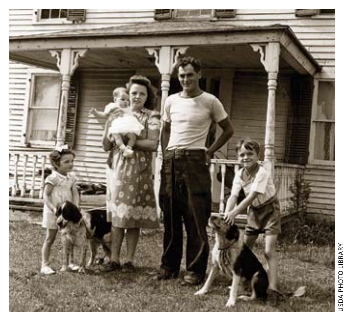
Young farm family—1940s.

Post-War Modernization of Agriculture. Post-war rising farm production was the result of many things, including the increasing use of improved mechanical equipment and introduction of improved varieties of crops and breeds of livestock. Modernization required the amount of capital to engage in farming to increase greatly. Prudent management became more dependent upon reliable statistics for market planning and operational decisions. Advantages of specialization became evident first by the chicken broiler industry where individual farm operations were replaced by chick hatcheries, feed processors, specialized housing, and poultry dressing plants.