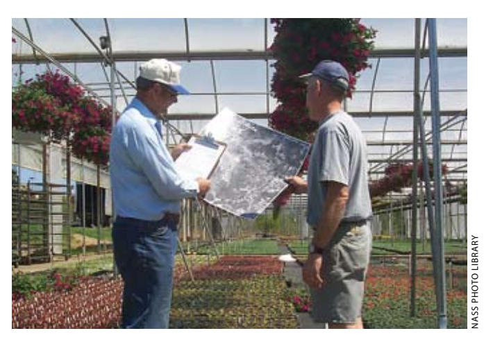
Enumerator interviewing a greenhouse operator.

staff to focus on its specialty—data collection, while NASS staff concentrates on survey integrity and data analysis. All NASDA employees are sworn to the same confidentiality pledge as NASS employees.