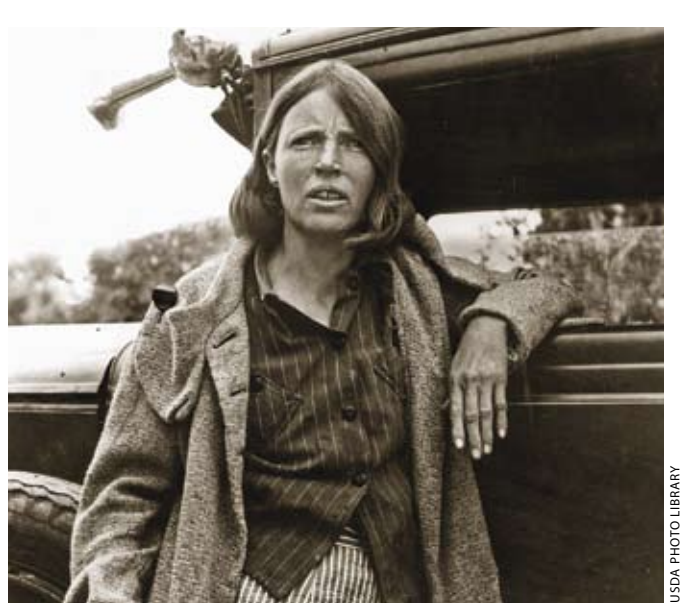
Farm Worker in Pinal County, AZ.

had numerous keys that the statistician operated as he drove down country roads. When the car was abreast of a field of corn, the corn key was depressed. If the next field was cotton, the cotton key was depressed, and so on for other crops or land use. This device provided the first objective measurement of the trends in crop acreage from year to year.