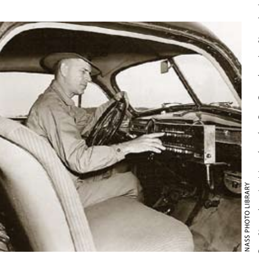
Survey statistician operating a crop meter.

Over time, statisticians' cars were equipped with crop meters. A crop meter was mounted on the car's dashboard and connected to the speedometer. The device