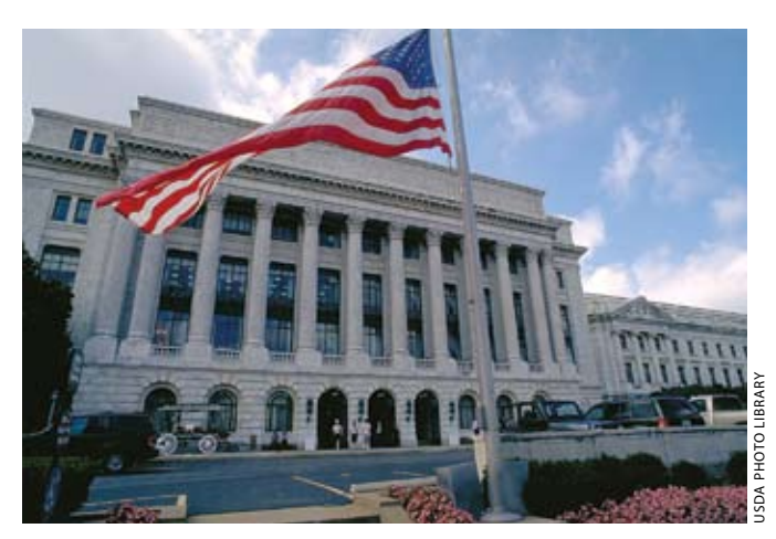
USDA Complex, Washington, D.C.

The National Association of State Departments of Agriculture (NASDA). NASDA provides grassroots support for the NASS mission by employing part-time field and office enumerators to collect survey data by telephone or in person. This partnership allows the NASDA