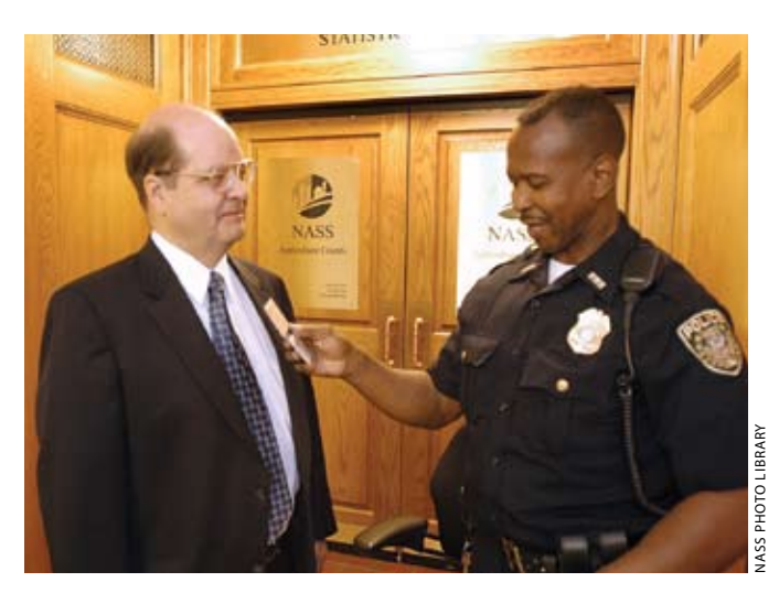
Guard protecting access to the NASS lockup area.

The organization's most important asset has always been its people—those who developed this complex and efficient statistical service in the past and those who maintain and improve it today.