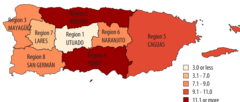
Total Value of Production by Region as Percent of Island Total, 2018